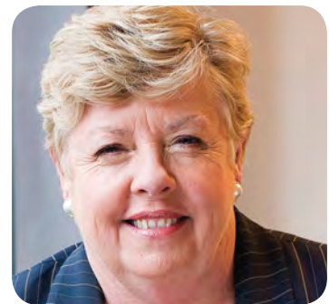
CHRISTINE NIXON APM

Christine is a noted presenter and currently works in advisory roles to a range of public and private organisations and individuals. She has qualifications and awards from various institutions and universities and vast experience in leadership and organisational reform.